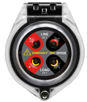
R-3MT-VI-3K/10LL-KIT Includes cap

Testing voltage for DC systems up to 3kV shouldn't be a gamble with safety. If you're working in utility-scale solar power, electric vehicles, electric rail systems, or EV charging stations, you are aware of the danger. Traditional methods for testing voltages above 1000 VDC demand specialized equipment, expose your team to increased electrical hazards and prolong Lockout/tagout (LOTO) procedures.