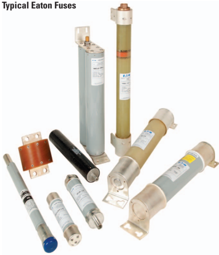
Typical Eaton Fuses