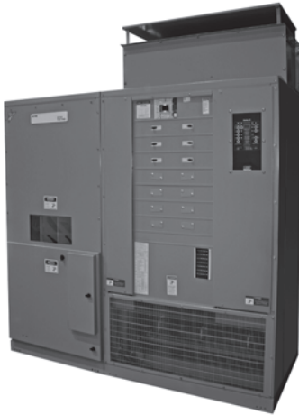
Bottom Cable Entry and Top Cable Entry