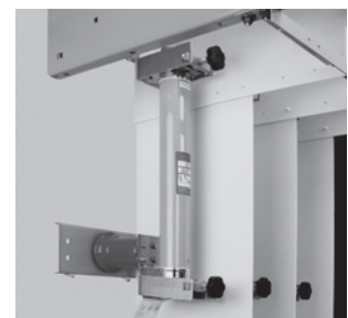
MVS-C Fuse Mounting

Fuse mountings: Complete three-phase fuse mounting assemblies or fuse live parts are available that are fully compatible with MVS-C switches. The fuse mountings are intended for use with Eaton's fuses.