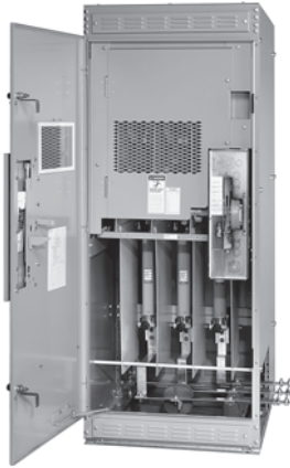
Indoor Medium Voltage Switch—MVS Bus Connection to Dry-Type Transformer