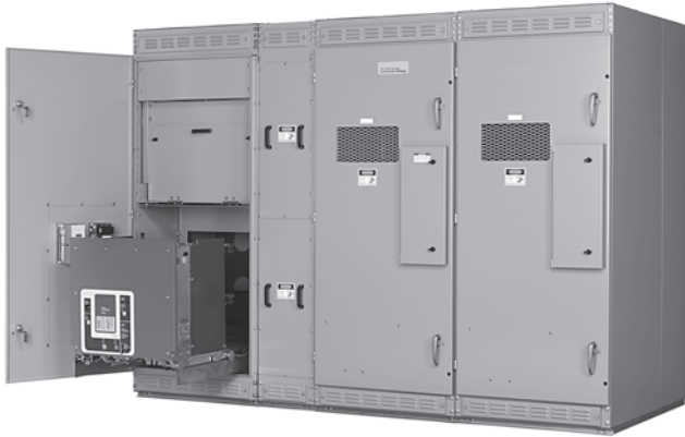
Indoor Metal-Enclosed Drawout Vacuum Breaker—MEB Used as Main for Two Fused Switches