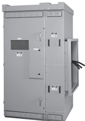
Outdoor Medium Voltage Switch